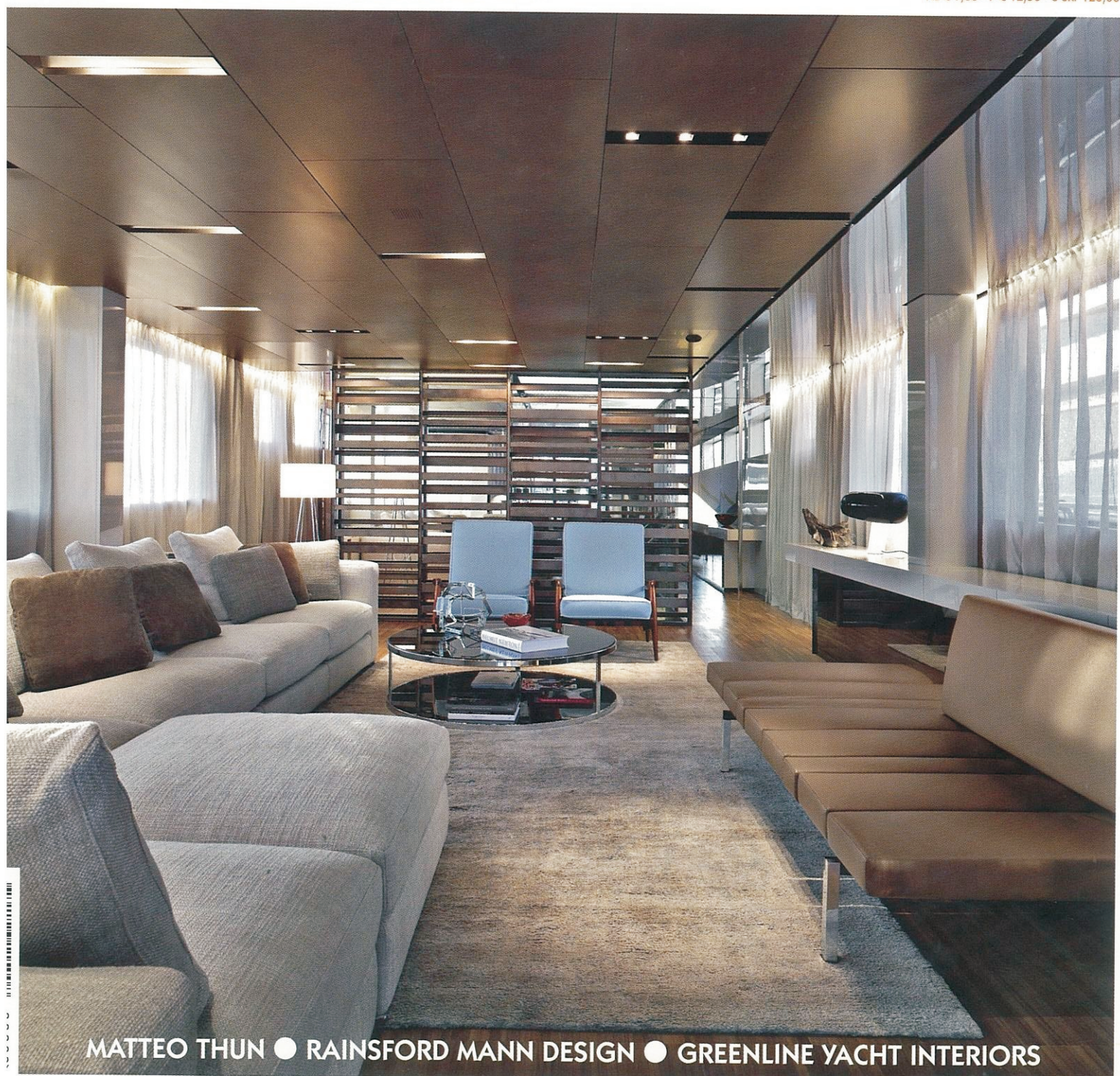
MATTEO THUN ● RAINSFORD MANN DESIGN ● GREENLINE YACHT INTERIORS

Year 14 n. 2/2010 - Bimonthly, March - April. Prices Abroad: I € 8,00 - UK £ 5,95 - L € 8,70 - CH Sfr 13,00 - B € 8,70 - F € 9,15 - D € 9,15 - E € 7,50 - A € 8,00 - GR € 8,30 - NL € 9,00 - P € 12,50 - S Skr 120,00